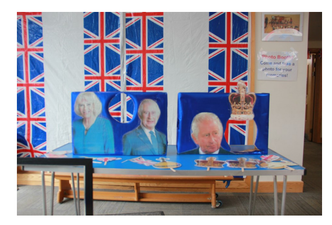
On Friday 5th May we managed to didge the rain and enjoyed an afternoon of celebrations in the run up to the Kings Coronation