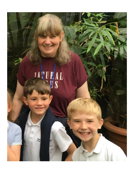
Puffins and Kingfishers class went on a school trip and visited the living rainforest