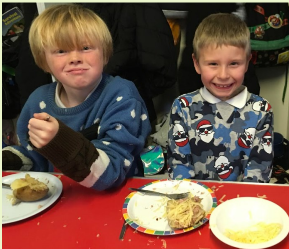
Children in Puffin class have been choosing toppings to try on jacket potatoes in DT this week