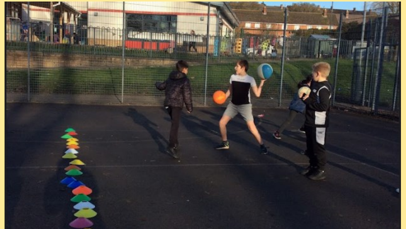
Year 6 playing dodgeball during their PE session this week