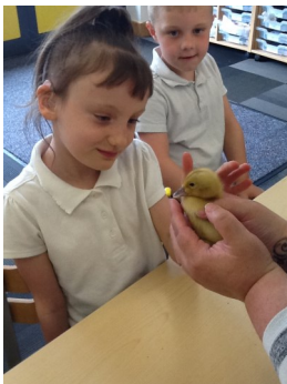
Bumblebees, Sparrows and Puffins class holding the ducks and watching them swim