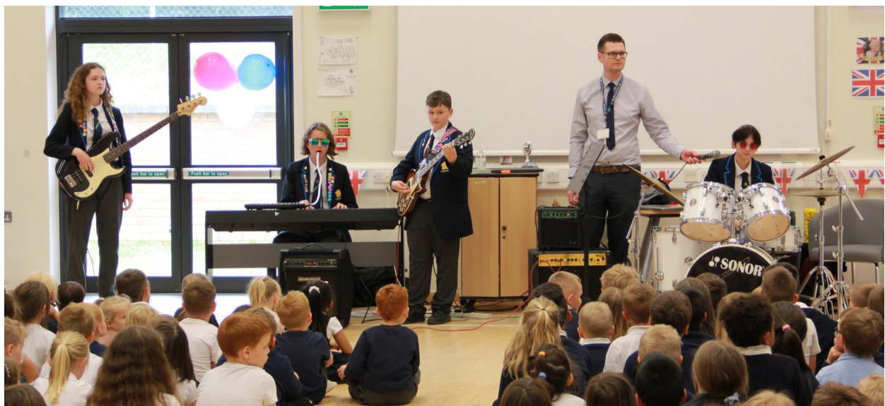
On Thursday we were joined by students from Kingsdown School who took us through the musical ages with some pieces they have been working on.