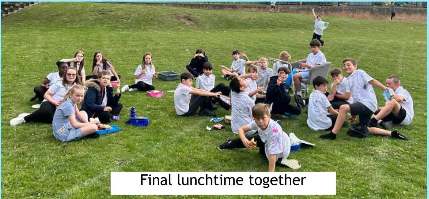
Final lunchtime together

Time to say our final goodbyes to our Year 6 cohort