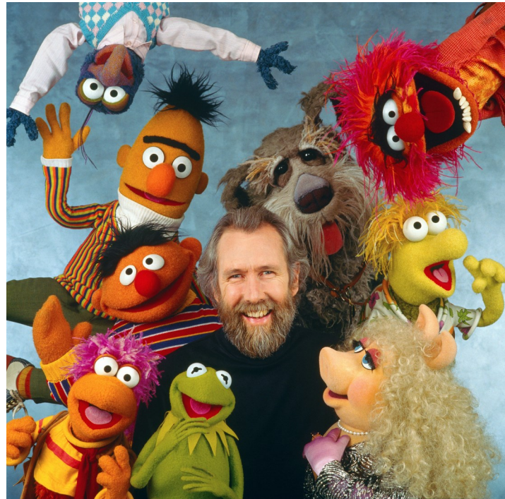
Jim Henson and the Muppets

Kermit the Frog is the most famous muppet.