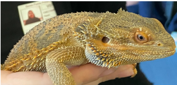
Reception class met Chance the bearded dragon. They asked lots of questions and were able to have very gentle cuddles. They also learnt about St George and the Dragon.